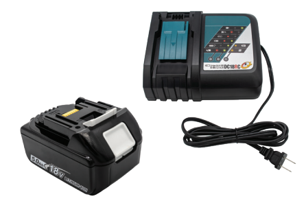
Spare Li-ion Battery

Battery & Charger – ME10000 Battery Only – ME10005