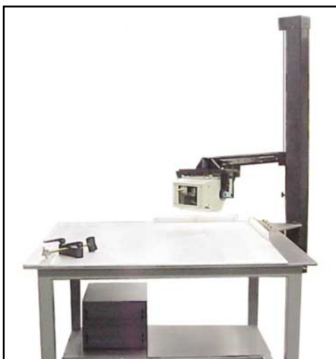
Custom universal marking table