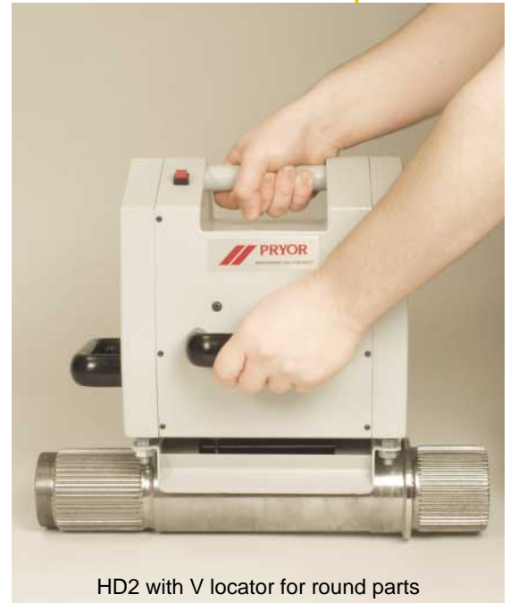
HD2 with V locator for round parts